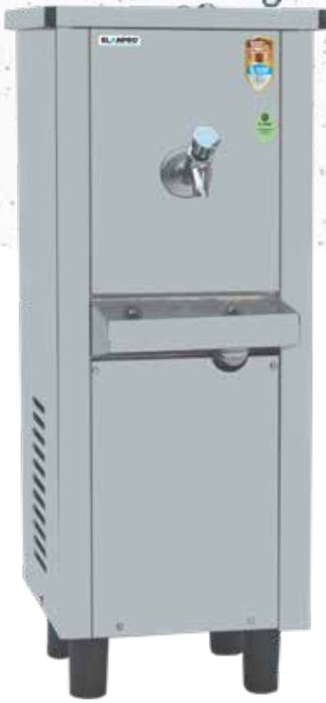
ESS 20/20, ESS 20/40